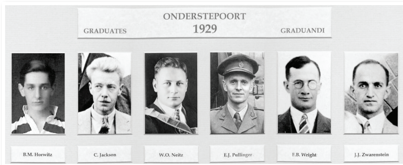
Fig. 2: The Class of 1929.